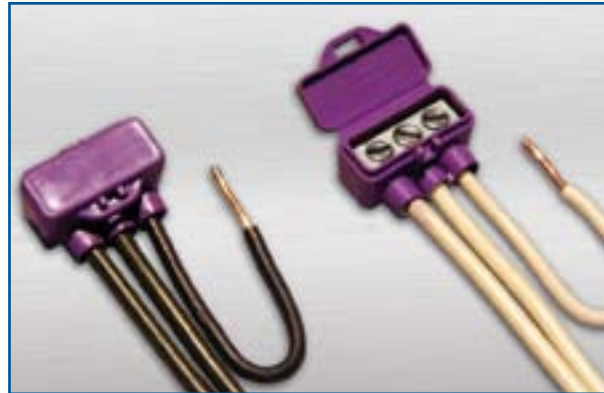
The AlumiConn Connector

CPSC staff recognizes that copper replacement may be cost prohibitive and that the COPALUM repair may be unavailable in a locality. Based upon an evaluation that was, in part, CPSC supported, 5 consumers are advised that, if the COPALUM repair is not available, the AlumiConn connector may be considered the next best alternative for a permanent repair. This repair method involves pigtailing using a setscrew type connector instead of the COPALUM crimp connector in the repaired connections. The AlumiConn connector has performed well in initial tests, but is too new to have developed a significant long-term safe performance history as the COPALUM repair. The repair should be conducted by a qualified electrician because careful, professional workmanship and thoroughness are required to make the AlumiConn connector repair safe and permanent.